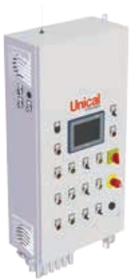
■ IML_OIL Board panel