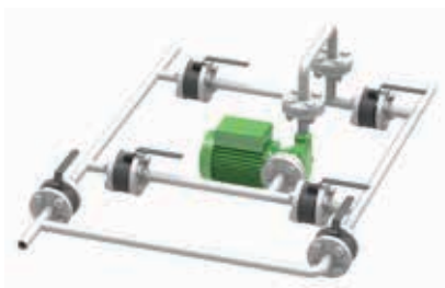
■ System oil loading pump