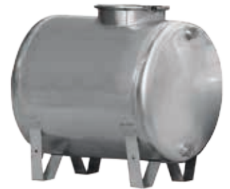
■ V_OIL Oil collection vessel