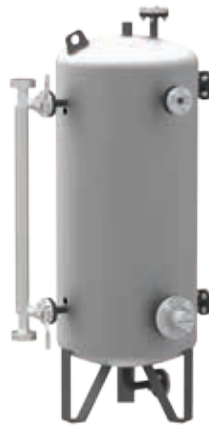
■ V_ATMO Open expansion vessel