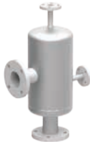
■ DG_OIL Dearator